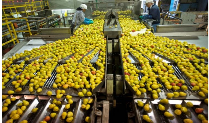
For commodity producers, a change in currency valuation or the rise of an industry in foreign country will bring a lower price option to the market.

Competition from low cost commodity producers in Chile, China, and Argentina