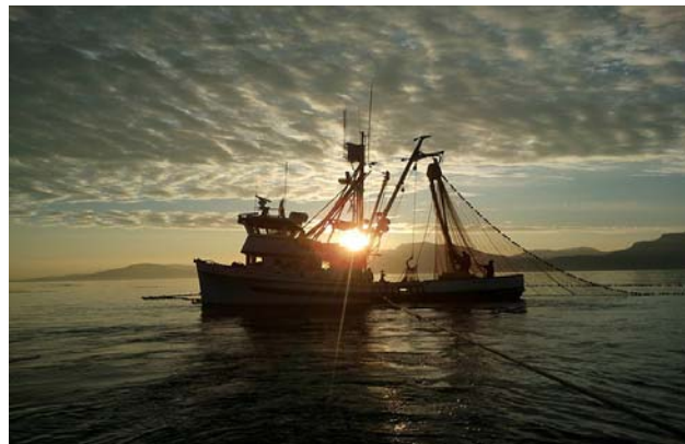
Usually a program for manufacturers, Northwest TAAC has made a dedicated effort to use TAAF in Alaska in the fishing industry.