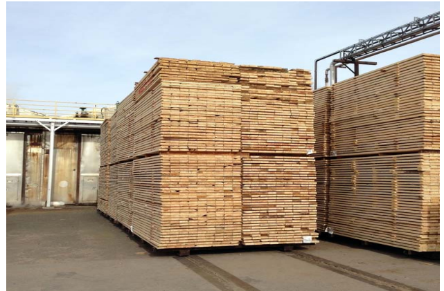
Disparities in forest management practices in the few soft-wood producing countries strongly affect business conditions for the industry.