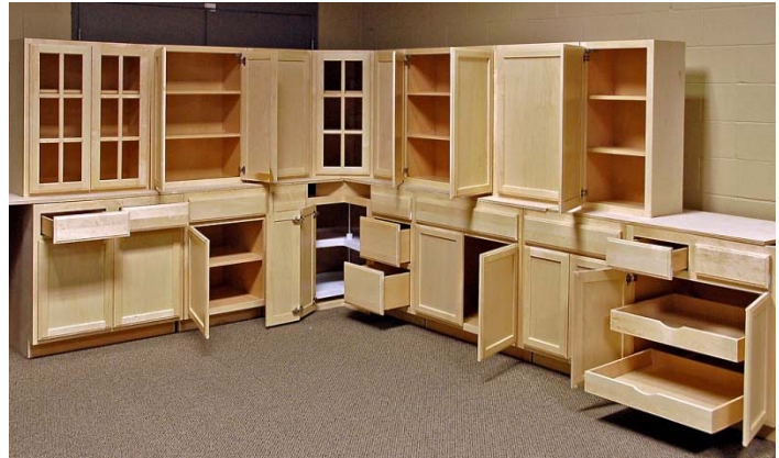
The burgeoning housing market of the early 2000's attracted imports, when the crash came, companies lost around 50% of sales - but the imports were still there.

Competition based on lower costs from China